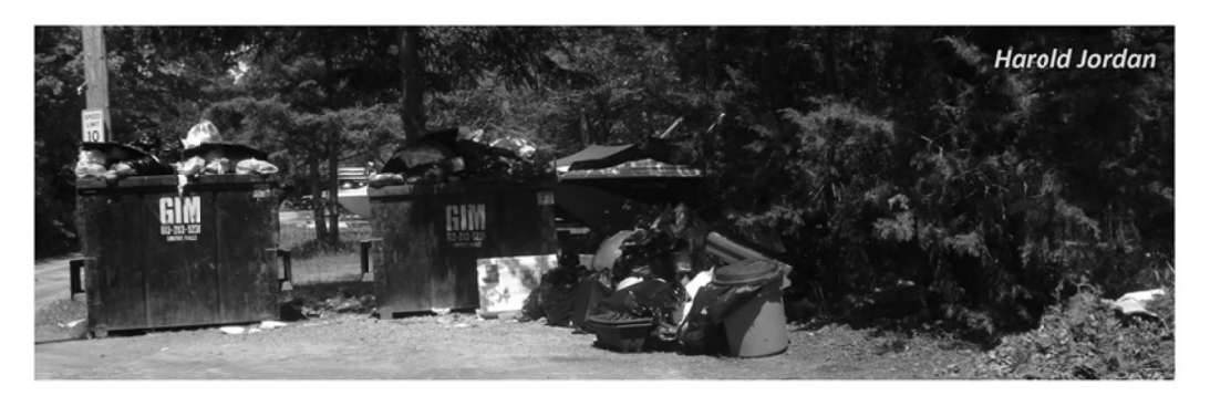
Drummond North Elmsley: Mississippi Road & McCreary's Landing June 11, 2017